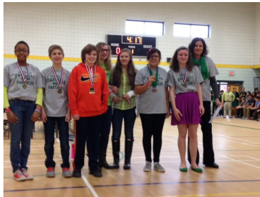
Parcells Science Olympiad Team